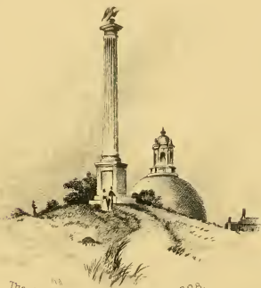
The Summit of Beacon Hill, 1808.

PUBLISHED BY Small Maynard & Company 6 Beacon Street BOSTON